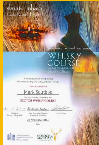
Moray College, Elgin, Scotland Scotch Whisky Course Certificate in the Understanding and Tasting of Scotch Whisky