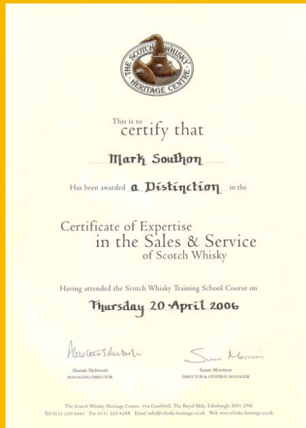
Scotch Whisky Heritage Centre Certificate of Expertise with Distinction in the Sales & Service of Scotch Whisky